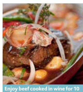
hours at Bistroy les Papilles

A beautiful bistro and deli with elegantly dressed tables and walls lined with wine and local produce, Bistroy les Papilles offers a quality of food that ensures its narrow interior is packed out every night. Its market-led menu is different every day, and is complemented by an exceptional wine list from its extensive wine cellars. Try its marmite du marché, or 'pot of the market' (lespapillesparis.fr; 30 Rue Gay Lussac; closed Sun, Mon & mid-Jul-mid-Aug; four-course menus £26).