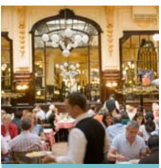
Despite humble origins, Chartier's décor is pure Parisian grandeur

This Parisian institution has clocked up more than a hundred years of custom in the same spot overlooking the Seine near Notre Dame. The menu is as authentic as a Parisian bistro gets, and changes depending on what's on offer at market, but canard aux pruneaux (duck with prunes) and ris de veau grand-mère (veal sweetbreads) are specialities (letrumilou.fr; 84 Quai de l'Hôtel de Ville; closed mid-Aug; mains from £11).