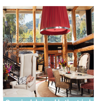
Oversized chairs add a theatrica rouch to the Sky Hotel's lobby

One of Aspen's few centrally located and affordable lodges, the family-owned Tyrolean Lodge resembles a Native American version of an Austrian ski lodge. The rooms here are spacious, with nifty accents including stone fireplaces and dark-wood panelling behind queen-sized beds (tyroleanlodge.com; 200 W Main St; from £60 in winter). There's a certain b&b intimacy at the Hotel Lenado, set in a