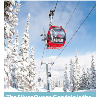
main link to Aspen Mountain

One of four ski mountains near Aspen, the 3,417m peak of Aspen Mountain is accessible from town via the free Silver Queen Gondola On the way up, take in views of the Elk Mountains – their sculpted peaks shine in the late afternoon sun – before skiing down Ruthie's, a wide-open run with even more sweeping views. The Sundeck restaurant, at the top of the mountain, cooks up lunchtime grills, sandwiches and homemade pizzas (aspensnowmass.com; day passes £15).