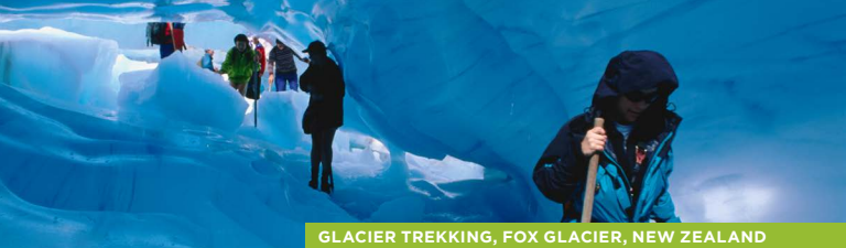
GLACIER TREKKING, FOX GLACIER, NEW ZEALAND