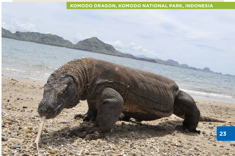
KOMODO DRAGON, KOMODO NATIONAL PARK, INDONESIA

From Lonely Planet Indonesia , 10th edition