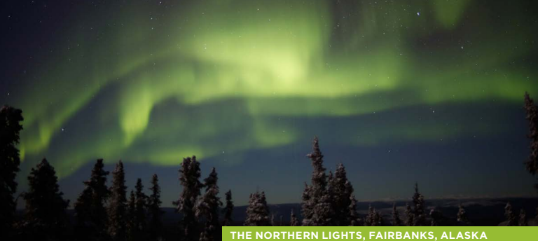
THE NORTHERN LIGHTS, FAIRBANKS, ALASKA