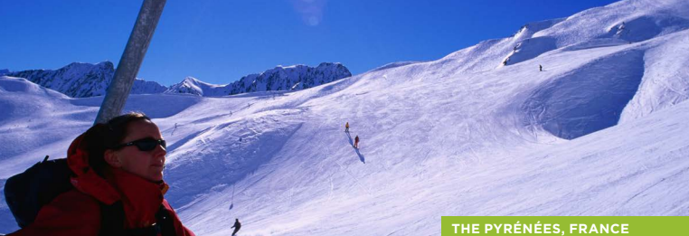
THE PYRÉNÉES, FRANCE