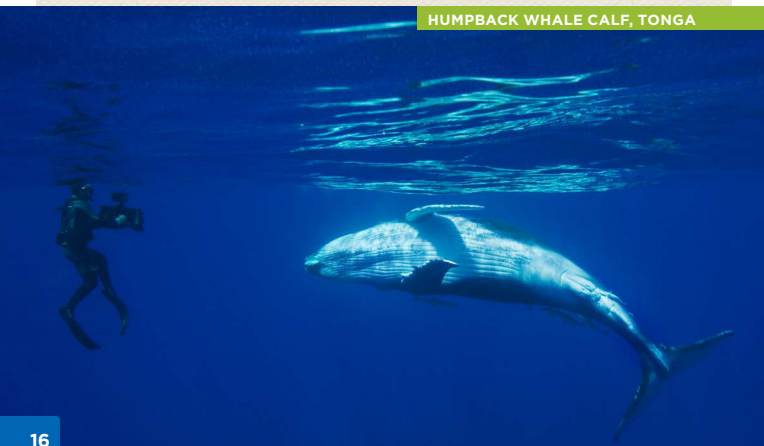
HUMPBACK WHALE CALF, TONGA

From Lonely Planet Rarotonga, Samoa & Tonga, 7th edition, and Lonely Planet's Best in Travel 2014