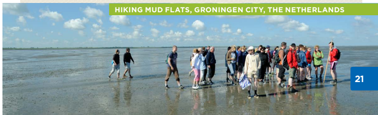
HIKING MUD FLATS, GRONINGEN CITY, THE NETHERLANDS

From Lonely Planet The Netherlands , 5th edition