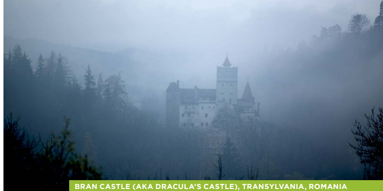
BRAN CASTLE (AKA DRACULA'S CASTLE), TRANSYLVANIA, ROMANIA