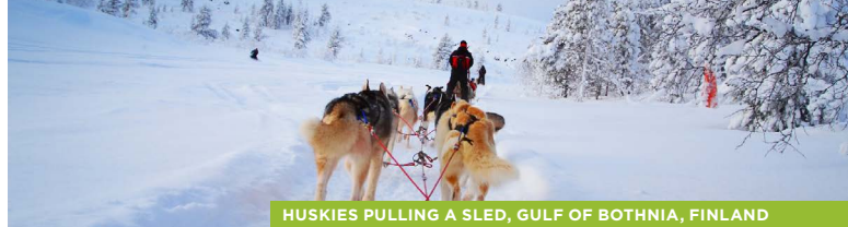
HUSKIES PULLING A SLED, GULF OF BOTHNIA, FINLAND