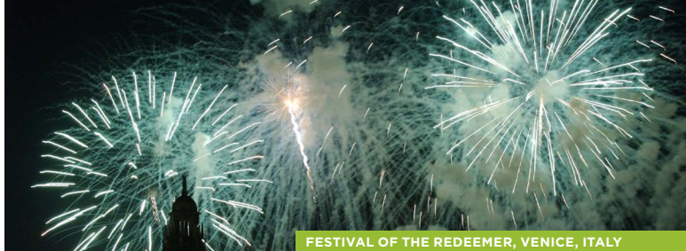
FESTIVAL OF THE REDEEMER, VENICE, ITALY