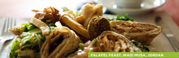
FALAFEL FEAST, WADI MUSA, JORDAN