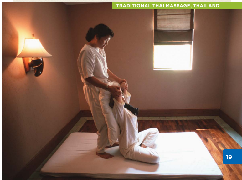
TRADITIONAL THAI MASSAGE, THAILAND

From Lonely Planet Thailand, 14th edition, and Lonely Planet's Best in Travel 2014