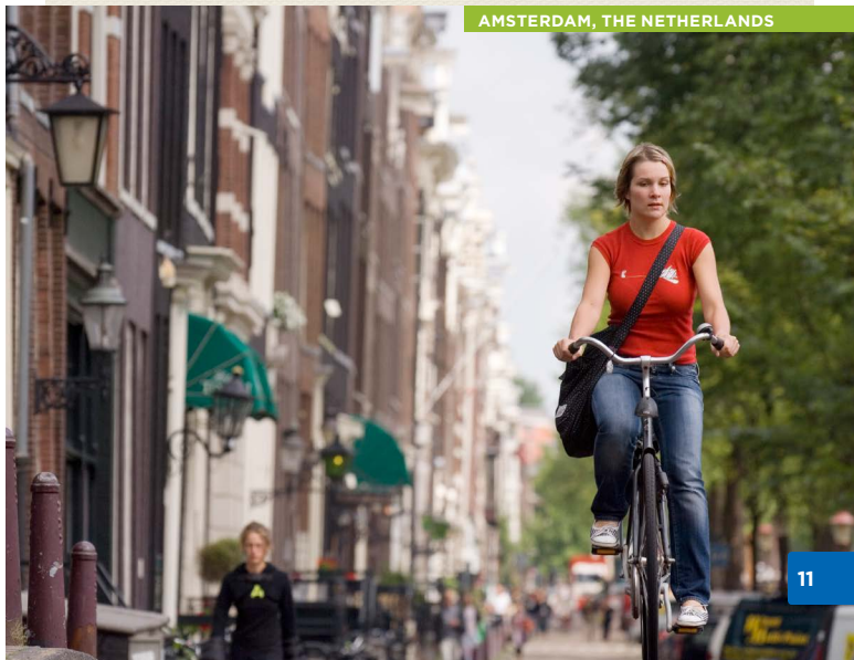
AMSTERDAM, THE NETHERLANDS

From Lonely Planet Amsterdam , 8th edition