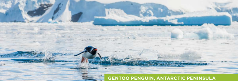
GENTOO PENGUIN, ANTARCTIC PENINSULA