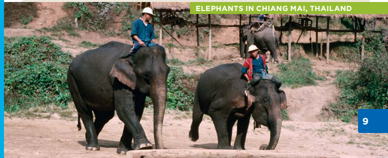
ELEPHANTS IN CHIANG MAI, THAILAND

From Lonely Planet Thailand , 14th edition