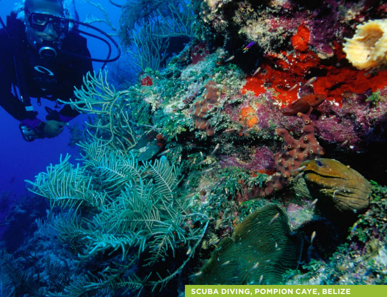
SCUBA DIVING, POMPION CAYE, BELIZE